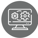
IMPLEMENTATION AND INTEGRATION